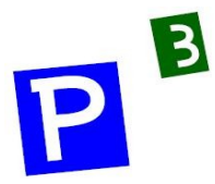
"The 3Ps of Vascular Access Success"

The 3 Ps for Vascular Access Success This handbook was designed to guide your hemodialysis vascular access improvement efforts and change existing practices through Quality Assessment and Performance Improvement (QAPI) projects. This handbook brings together a number of best-practice concepts and suggested tools in support of those concepts.